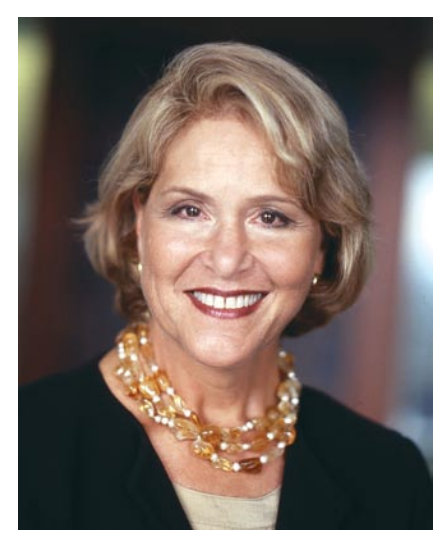
Rockefeller's Rodin: Let them eat tourism? Tourism was her idea of "development" for Africa.